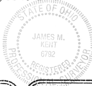
James M. Kent, P.S. 6792 OH

CLIENT CHARLES KANTNER DATE 1-30-02 COUNTY AUGLAIZE TOWNSHIP DUCHOUQUET SECTION 34 T- 5 -S; R- 6 -E DRAWN BY JMK DRAWING NO. 3800 SHEET 1 OF 1