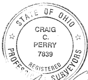
Craig C. Perry Reg. Surveyor # 7839

Note: This plat and description prepared from an actual field survey, all bearings refer to the centerline of County Road 251 as being N. 00°-00'-00" E.