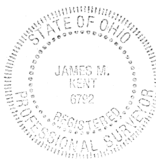
James M. Kent, P.S. 6792 OH

CLIENT SCHULTZ DATE 9-2-98 COUNTY AUGLAIZE TOWNSHIP WASHINGTON SECTION 8 T- 6 -S; R- 5 -E DRAWN BY JMK DRAWING NO. 3154 SHEET 2 OF 2