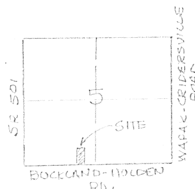
VICINITY MAP SECTION 5

PART OF THE SW. 1/4 OF SECTION 5, T-5-S, R-6-E DUCHOUQUET TOWNSHIP, AUGLAIZE COUNTY, OHIO