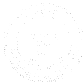
James M. Kent, P.S. 6792 OH

CLIENT RAUSTON DATE 7-18-01 COUNTY AUGLAIZE TOWNSHIP ST. MARYS SECTION 2 T- 6 -S; R- 4 -E DRAWN BY JMK DRAWING NO. 3781 SHEET 1 OF 1