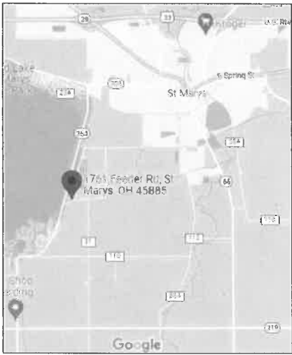
VICINITY MAP (NTS)

BEARING BASIS: E LINE ~ N.E. \frac{1}{4} SEC. 17 S 00° 42' 25" W PER OR 716 PG 3972